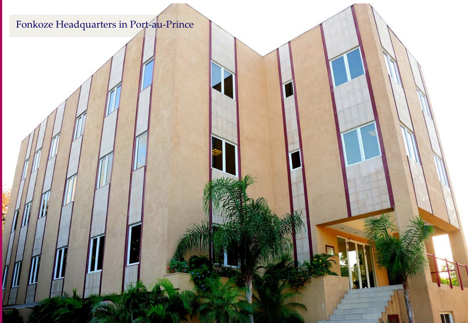
Fonkoze Headquarters in Port-au-Prince

Thank you for your support in enabling us to make a difference.