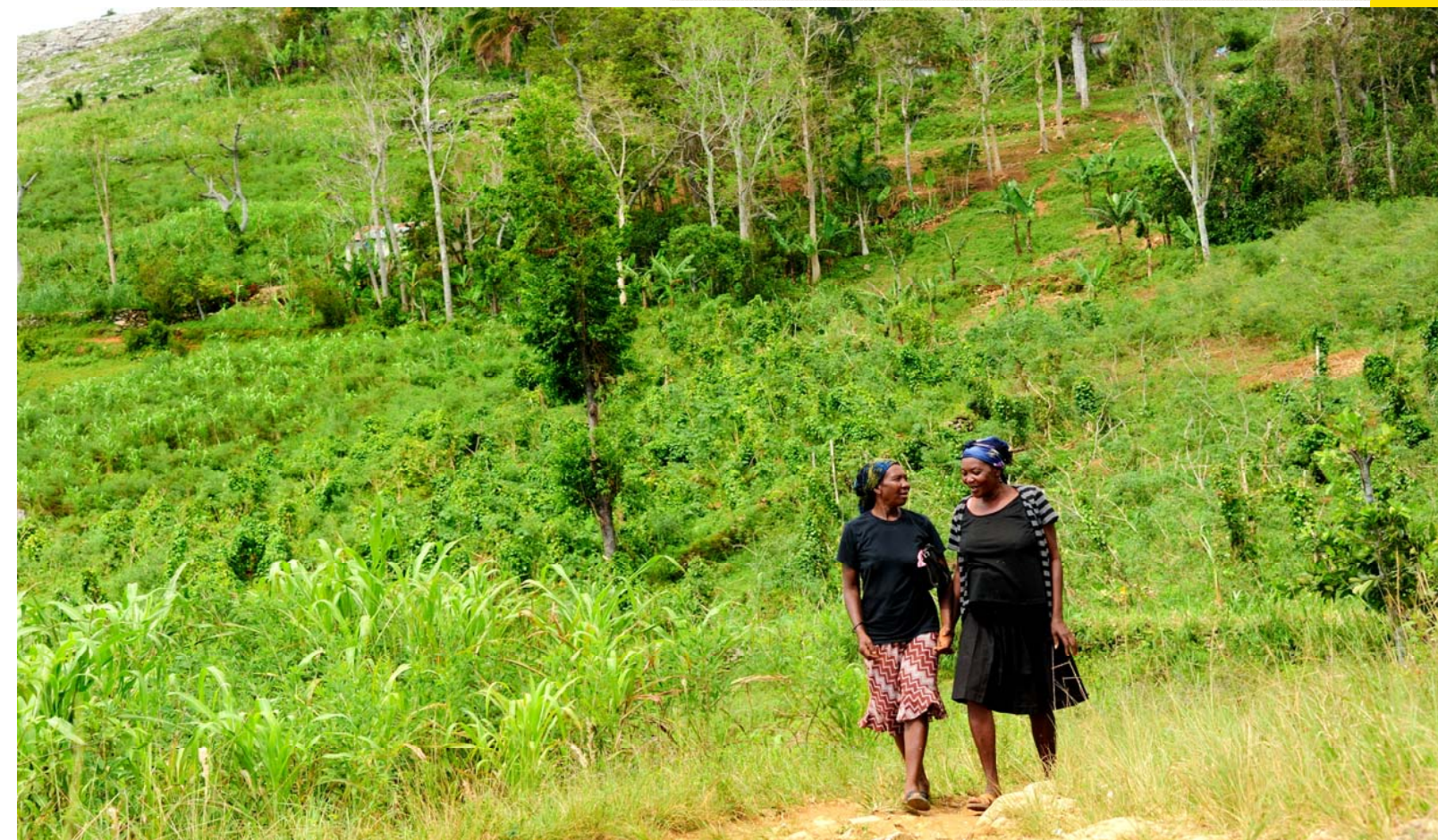
SFF Solidarity clients pictured walking to a center meeting